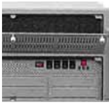
Replaceable Function Panel