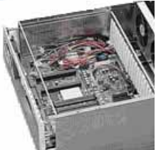
Detachable Card Cage